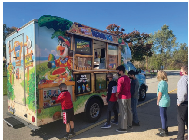
Students earned Kona Ice for positive behaviors in the cafeteria.

In March, Elizabeth Forward Middle School was honored to implement School-wide Positive Behavior Interventions and Supports (SWPBIS) at Tier 1 with fidelity. SWPBIS is a framework designed to enhance students' understanding of behavior expectations at school. The program follows the motto of being a BRAVE Warrior: Be safe, Respect others, Accountable, Victorious, and Enthusiastic. Students earn "Brave Bucks" by following defined expectations in all areas of the school, including the cafeteria, classrooms, restrooms, hallways and stairs, and during assemblies. The purpose of the program is to create a positive environment where all students are taught pro-social behaviors so that they achieve academic and lifelong success.